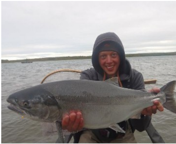
Fresh Silver Salmon like single and cluster eggs