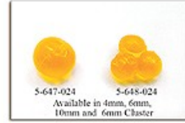
Available in 4mm, 6mm, 10mm and 6mm Cluster Otter's Soft Milking Eggs® -Apricot