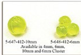
Available in 4mm, 6mm, 10mm and 6mm Cluster Otter's Soft Milking Eggs® -Kiwi