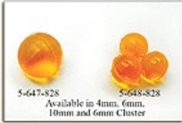
Available in 4mm, 6mm, 10mm and 6mm Cluster Otter's Soft Milking Eggs® -Tangerine