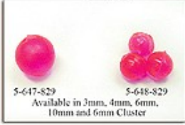
Available in 3mm, 4mm, 6mm, 10mm and 6mm Cluster Otter's Soft Milking Eggs® -Tango