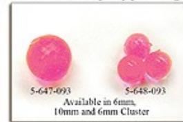
Available in 6mm, 10mm and 6mm Cluster Otter's Soft Milking Eggs® -Flamingo