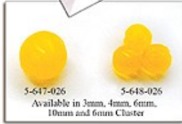
Available in 3mm, 4mm, 6mm, 10mm and 6mm Cluster Otter's Soft Milking Eggs® -Apricot Opaque