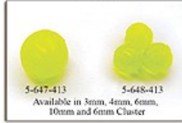
Available in 3mm, 4mm, 6mm, 10mm and 6mm Cluster Otter's Soft Milking Eggs® -Kiwi Opaque