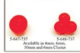
Available in 4mm, 6mm, 10mm and 6mm Cluster Otter's Soft Milking Eggs® -Ruby