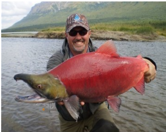
Sockeye Salmon in full spawning color.