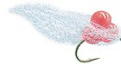
Otter's Soft Milking Eggs® Cluster-Ruby