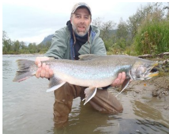
Fall Char starting to get spawning color.